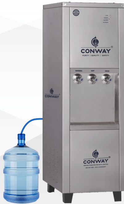
BWD 100 Model