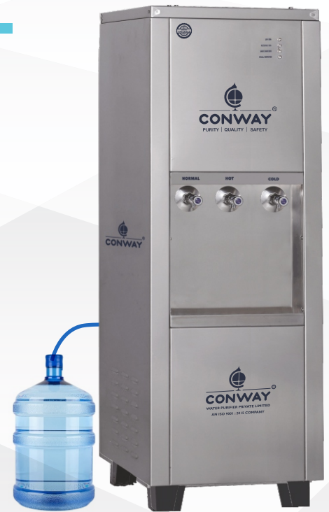
BWD 125 Model

At Conway, we follow a customer-centric strategy where the development of products is guided by a profound understanding of the needs, preferences, and challenges of our customers. We actively study and analyze the market, customer feedback, and trends to inform the creation of products that align with our customers' expectations. By taking this approach, we address specific pain points or desires of our customers, thus increasing the likelihood of successful product adoption and overall customer satisfaction. Our unwavering commitment to excellence guarantees the purity, quality and safety of our water purifiers and dispensers, ensuring a secure source of pure drinking water for all our esteemed customers and users.