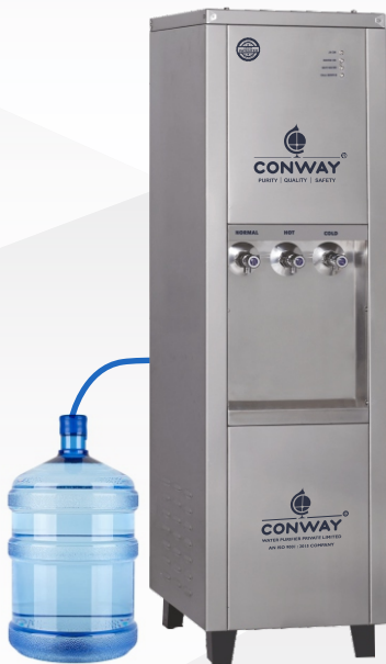
BWD 75 Model